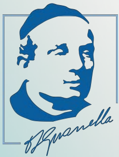
'The phase of Provincial Chapters'