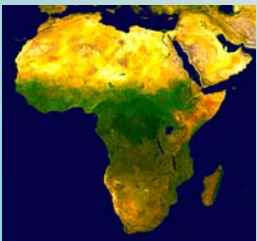
'Twenty-five years ago our guanellian presence in Africa was beginning...'