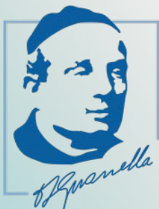
‘The Heart of Jesus, model for our love’