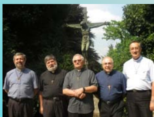
From the General Council