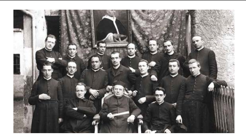
24March. 1908 "The First Profession of the Servants of Charity"