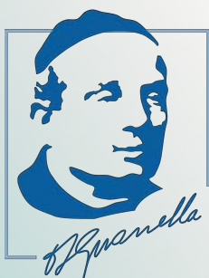
‘On the way to the XX General Chapter’