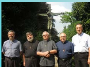
From the General Council